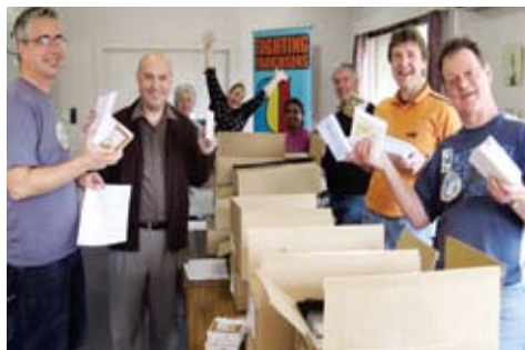
As part of the National Australia Bank's Corporate Social Responsibility Program, staff volunteered to assist with our 2007 Christmas card fundraiser by packing cards.

finding a cure and securing improved services and support for people living with Parkinson's.