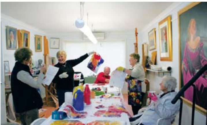
Members of the Art for Parkinson's group getting creative in the studio.