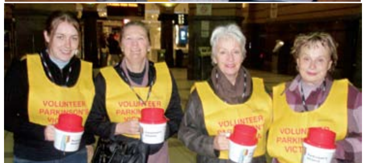
Volunteers from our 2007 National Parkinson's Awareness Week and World Parkinson's Day tin rattles at Melbourne Connex city loop train stations. Donations from morning commuters for the 2 days raised almost $7,000 in just 4 hours!